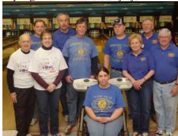
Bowl for Kids' Sake 2010 Team